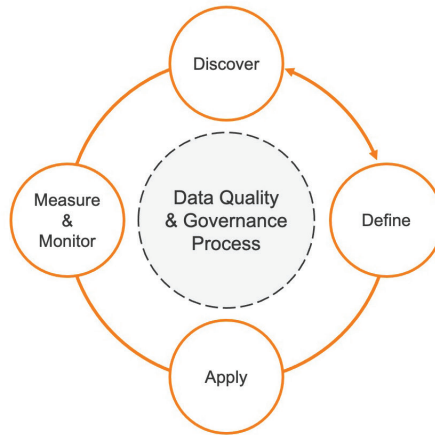
Figure 2: Informatica’s Data Quality Management Process provides a comprehensive, holistic approach to dealing with data quality issues, helping organizations continuously improve data quality on-premises, in the cloud, and in a combination of both environments.

Regardless of the size or location of your university or the volumes and types of data that you work with, you can manage the entire data quality process with Informatica Data Quality. Whether your project is centered on working with student or third-party data, product or supplier data, finance data, or data from IoT devices, Informatica Data Quality will ensure that you can trust the quality of your data.